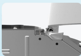
Profile flip structure