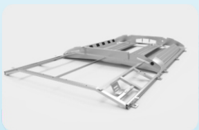
All aluminum frame shell