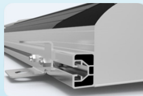
Standard fixing bracket